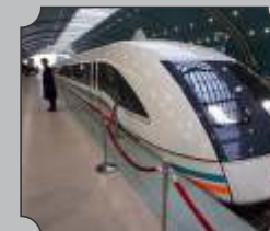
Metro Rail Project