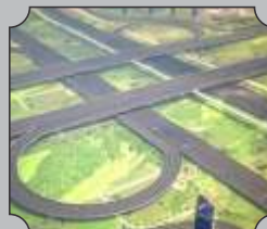
6 Lane Highway